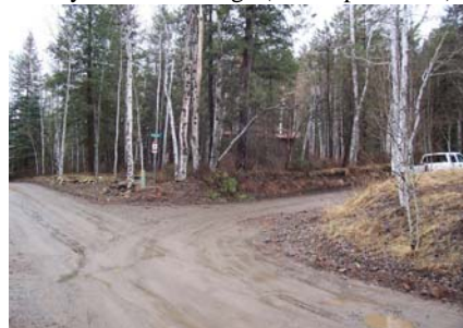
#5 Black Load Trail (first Right)