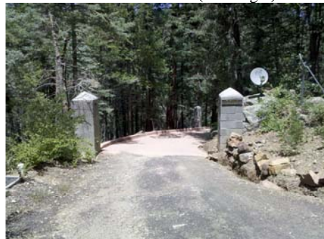
Entrance to MG Lodge