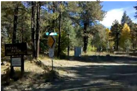
Potato Patch Entrance (Poachers Row)