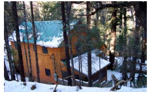
#6 MG Lodge as seen from Black Load Trail