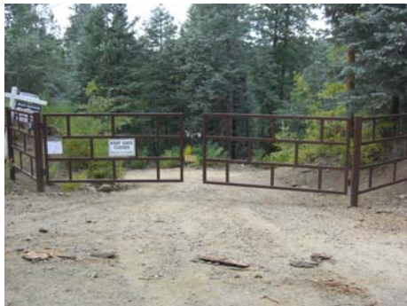
#7 Millsite Village Gated Entrance