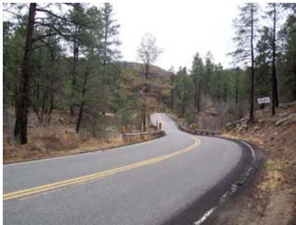
#1 One Lane Bridge